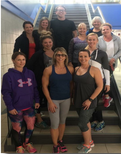
The group fitness volunteer team attended Y's in Motion at the YMCA of Greater Moncton to enhance their education.