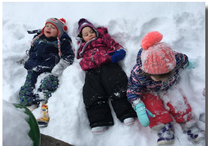
Childcare kids are having snow much fun! Outdoor play is a critical part of gross motor development.