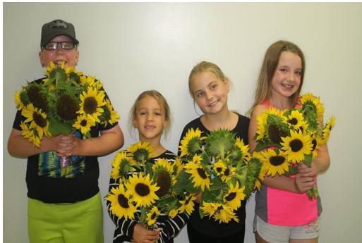
Flowers from the garden were delivered to friends at Gables Lodge!

In the Spring of 2017, the YMCA of Cumberland Youth Community Garden was planted through the Full of Life Program. The project started as a way for youth to gain some hands-on education about agricultural sustainability.