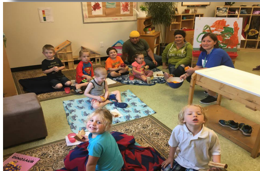
Family Picnic: The parents of the children in child care were invited in for a lunchtime picnic!