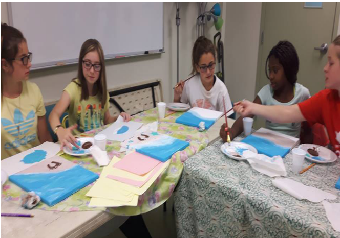
Full of Life Paint Nights, a free program in our Youth Centre were a hit for youth ages 6-13.