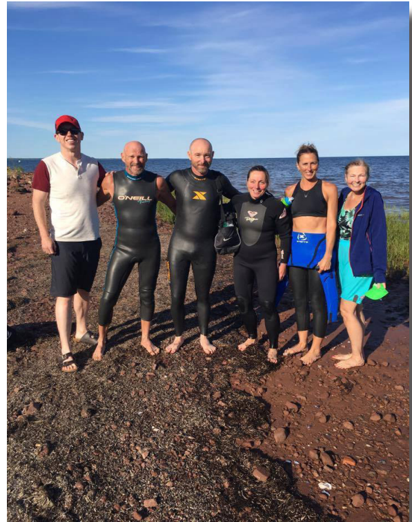
Members and friends of the Y swam from New Brunswick to Nova Scotia (6km) to raise awareness for our Strong Kids Campaign.