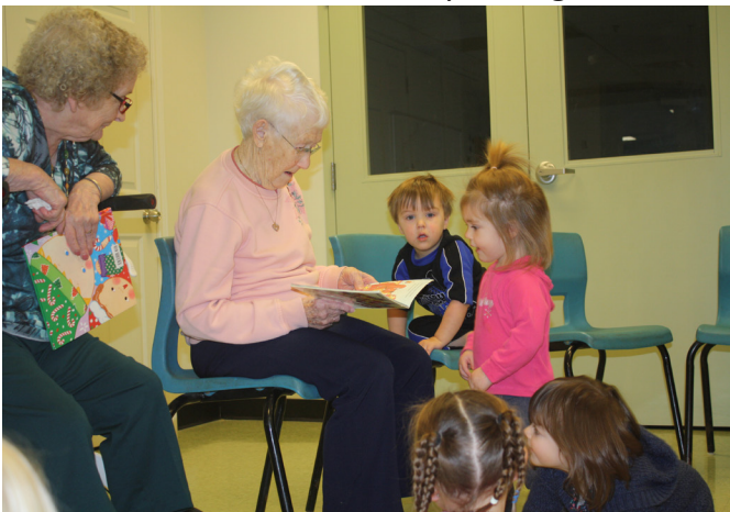
Seniors from the Centennial Villa stop by monthly for reading time and other fun intergenerational activities.