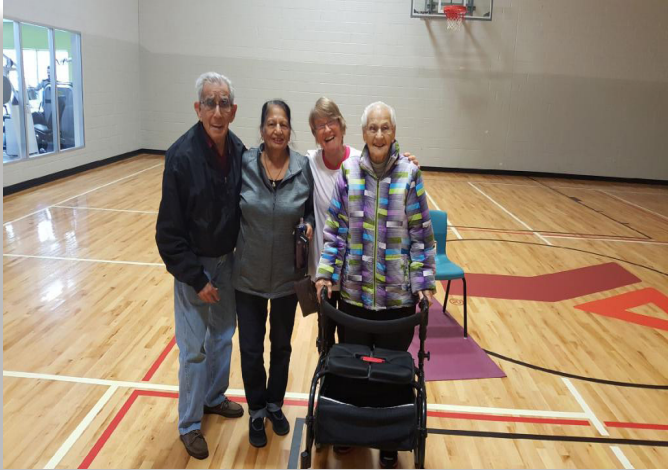
Group Fitness Participants

637 individuals were assisted through our financial program (439 were under the age of 17).