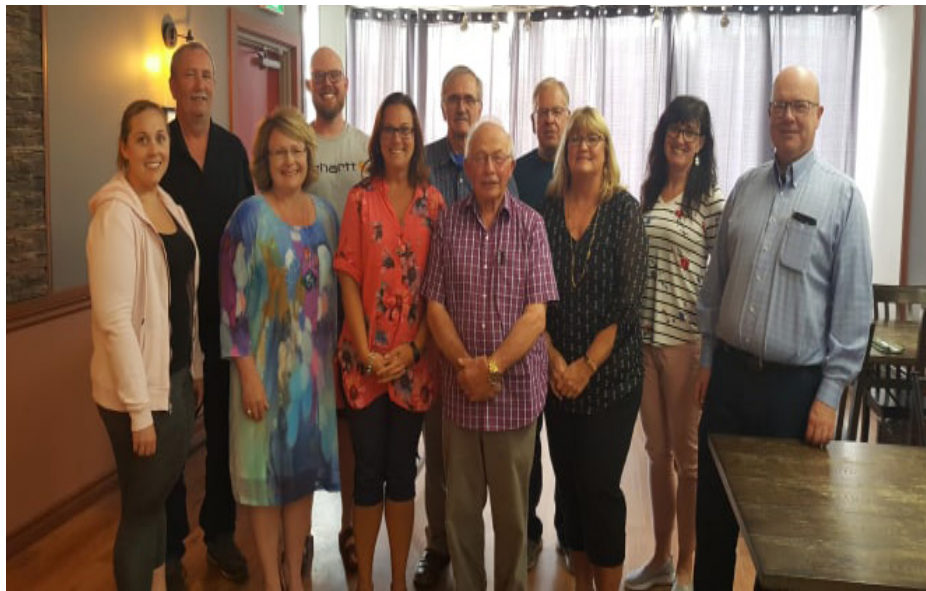
YMCA of Cumberland Board of Directors

106 volunteers assisted our YMCA in programs, governance, committees and special events.