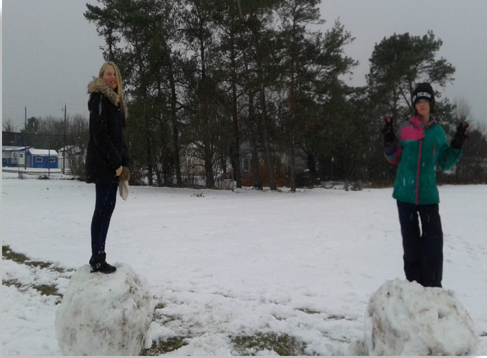
Youth on the Move - program participants