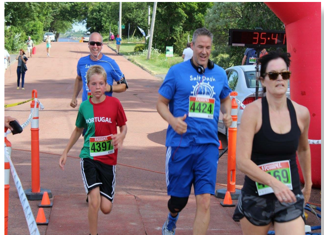
HarbourFest Salt Dash

$79,220 was provided in financial assistance to community residents ($32,565 of this was for participants under 17 years of age).