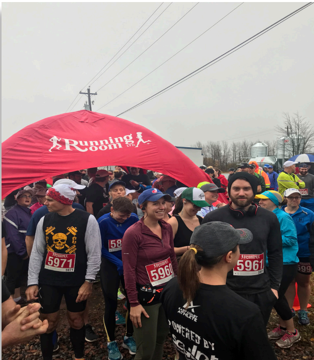
Trider's Trail Run