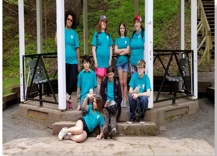
After the Bell program participants visited Victoria Park.