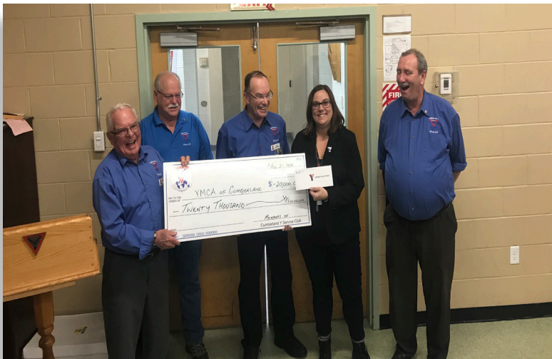
Club members presenting their annual donation to the YMCA.

In total, 4,071 volunteer hours were spent at the YMCA of Cumberland in the past year. Thank you!